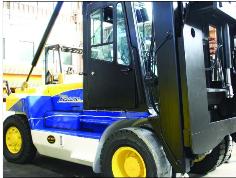
Oakdale Yacht Service was one of the first marinas to have a Neptune Series with an enclosed cab.

With plans to serve as his summer and holiday residence, a lavish, 110-room wooden mansion was constructed in 1882. On April 15, 1899, while Vanderbilt's son, Willie K. II, was honeymooning there, the prominent Idle Hour residence was destroyed by a fire. Willie and his new bride escaped, but jokes quickly circulated that his wife was so hot that she was the reason for the fire.