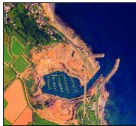
Aerial view of Penlee Quarry.

Penlee Quarry, located just south of Newlyn in Cornwall, will have 24-hour tidal access, which in conjunction with proposed schemes at Newlyn and Penzance, will greatly increase the sailing area to the West of Falmouth. Also, the Lizard will act as a convenient visiting point to those looking to sail onto the Scilly Isles, Ireland and France. Penlee will offer 195 berths, drystack facility, hotel, residential properties and retail. The scheme is at an early stage with a flexible approach being adopted so as to complement neighboring projects at Newlyn, Penzance and Scillies. MDL intends to create a high quality marina with good architecture and planning with a consideration being given to environmental opportunities such as harnessing energies from the sea.