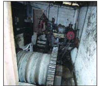
Manufactured by Silent Hoist & Crane, the original winch used more than 75 years ago is still intact at Grove Key Marina.

The winch used back in the 1920s was manufactured by Brooklyn, New York-based Silent Hoist & Crane, the historic company that is now Hoist Liftruck.