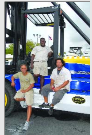
Staff at Grove Key Marina.

"Hoist has been great at rectifying any issues on the truck, assessing our needs and making necessary corrections and repairs. I've seen the frequent breakdowns and poor service support on other trucks, which helped us narrow our options and eventually led to the Neptune."