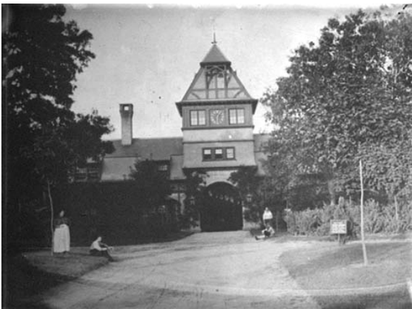
Idle Hour mansion

When some people think about the history of Oakdale, New York, extravagant mansions come into mind, most notably Idle Hour. In 1876, William K. Vanderbilt, grandson of railroad magnate Commodore Cornelius Vanderbilt, purchased 900 acres from Montauk Highway to the Great South Bay, on the east bank of the Connetquot River, which the estate was named Idle Hour.