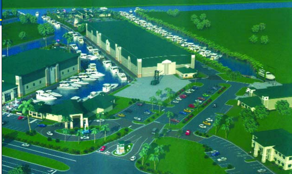
Ft Myers BoatClub will join Barefoot BoatClub in Naples, Naples BoatClub and Ft Lauderdale BoatClub

After successfully completing Naples BoatClub and Barefoot BoatClub, BoatClubsAmerica is developing Ft Myers BoatClub and has