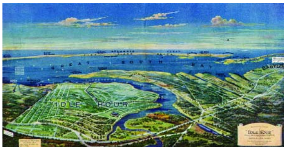
This layout shows the enormity of the 900-acre Idle Hour estate and the surrounding area.