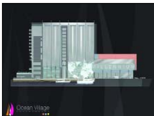
The proposed Millennium Hotel at Ocean Village.

With hopes to make the area an destination for tourists and businesses, a 225-bed hotel has been proposed, which would be Southampton's first true waterfront hotel. Two distinct piazzas have also been proposed that would host various maritime events, concerts and festivities.