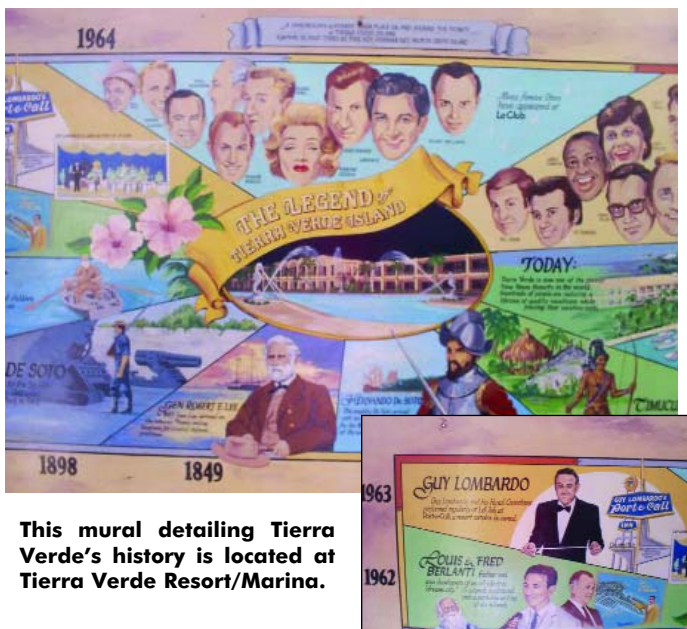
This mural detailing Tierra Verde's history is located at Tierra Verde Resort/Marina.

When the bodies of the Berlantis were found in Lake Okeechobee after their airplane exploded, questions of the accident swirled around the area including possible under-the-table activities. Tierra Verde was handed over to Murchinson, who owned the island for 14 years when a new venture called Tierra Verde Company took over in 1977, the same year Lombardo passed away.