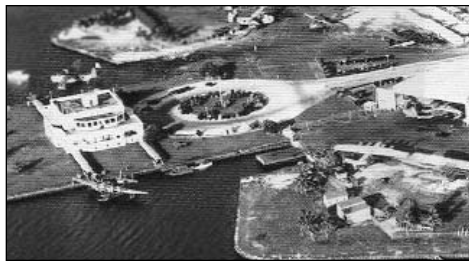
Dinner Key area during WWII and present day.

In 1930, Pan American Airways (Pan Am) selected the former navel air base for its inter-American flights after acquiring New York-Rio-Buenos Aires Airline, which flew flying boats between Miami and Buenos Aires. Between 1931 and 1938, four hangars were constructed to house and service Pan Am's fleet of Clipper seaplanes, as well as its new terminal building.