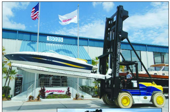
MarineMax in Clearwater, Florida

MarineMax also offers many financing options on new or pre-owned boats, as well as various insurance options. A dedicated online business department assists customers with services such as trade evaluations and finance options over the Internet.